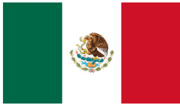
This is the flag of Mexico.