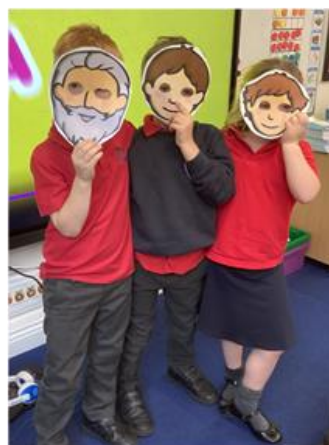
The father was so happy that they threw a party.