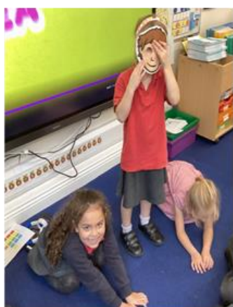
The son was so hungry he had to work for a farmer and was jealous of the pigs' food.

Year One have been learning different parables from the bible to answer the question 'What do many Christians believe about God?' We enjoyed acting out the story of 'The Lost Son' and discussing our favourite parts.