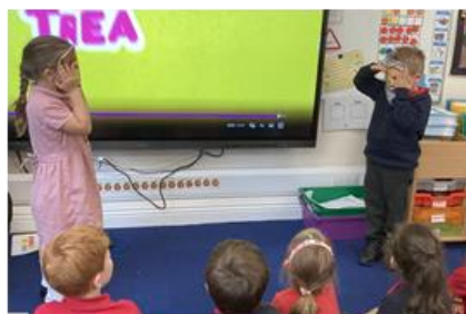
The father missed his son and looked for him to return.