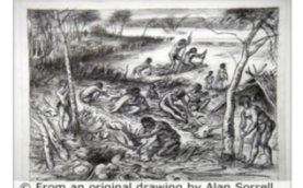
© From an original drawing by Alan Sorrell