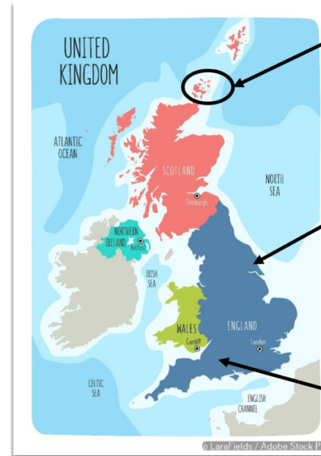
Skara-Brae is a Neolithic settlement in the Orkney Islands.