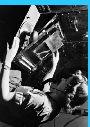
RAF aircraft plotters