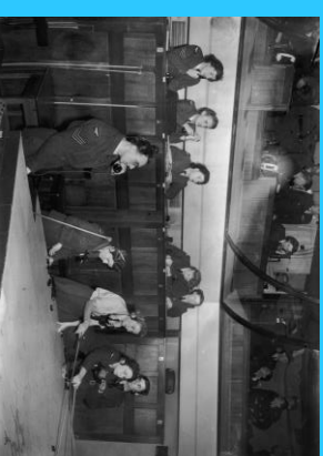
RADAR operator Command headquarters