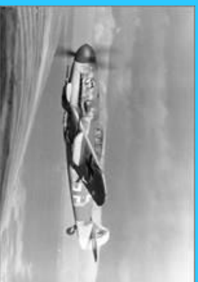
Messerschmitt bf 109