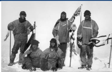
Captain Oates, Bowers, Edward Wilson, Captain Scott and Evans.

Captain Robert Falcon Scott was an English polar explorer. He kept a diary of his voyages.