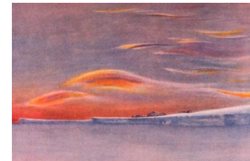
An Edward Wilson watercolour painting