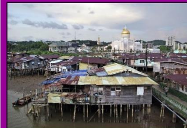
The Village of Kampong Ayer, Bandar Seri Begawan