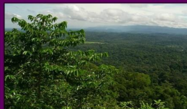
Tropical Rain Forest