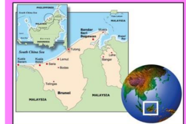
The Nation of Brunei in South East Asia