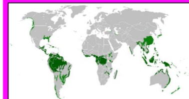
Distribution of Tropical Rainforests in the World